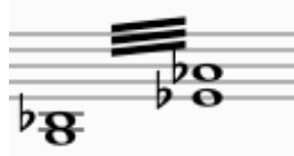
Double Vertical Roll